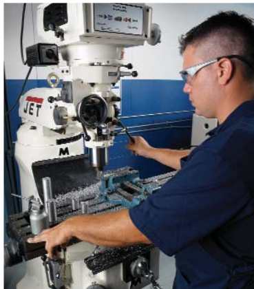
Drilling bar stock on the Milling Machine.