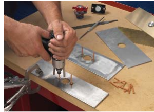
Welding threaded studs onto elevator call plates with the Stud Welder.