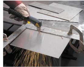
Precision cutting of stainless steel with the Plasma Cutter.