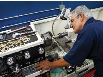
Preparing to bore brass spacers on the Spindle Bore Lathe.