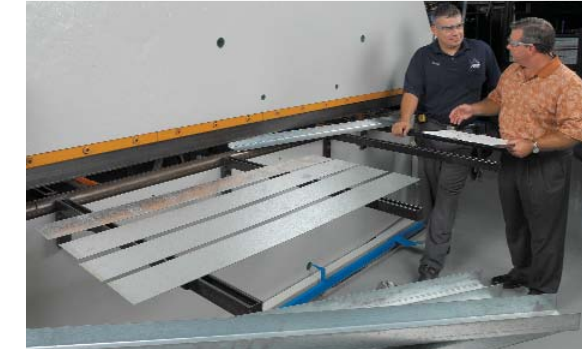
Forming a lip for a stainless steel door cladding on the Press Brake.