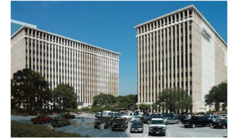
A well-planned, multi-faceted building restoration is underway at Greenway One and Two.

A revitalized exterior for the Greenway Plaza landmarks is underway by skilled AMST Exterior Division crews using advanced technology and exacting quality standards. The crews are successfully preserving and restoring the architectural integrity, longevity, and appeal of the buildings while curbing or reversing deterioration of building surfaces. The well-planned building maintenance program includes concrete repair, waterproofing and color coating the buildings. The result – a renewed, vibrant image and maximum property value.