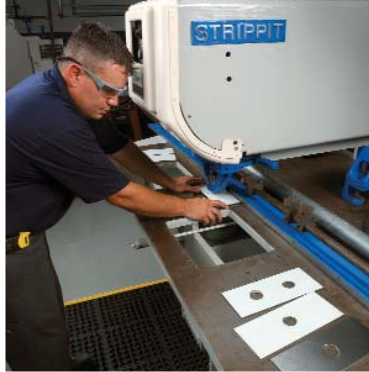
Precision, close-tolerance hydraulic hole punching for a button panel.