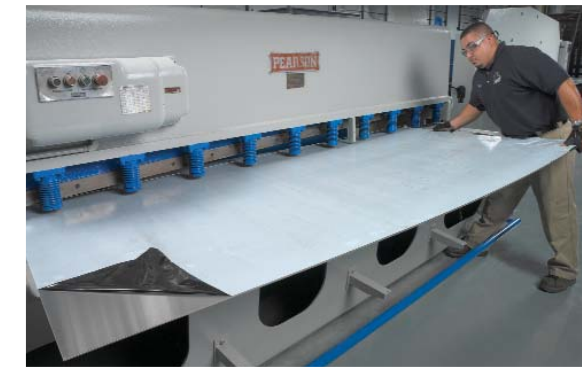
Rafael Sandoval shears a large sheet of stainless for recladding interior doors on the Heavy-Duty Mechanical Shear.