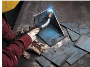
Welding a steel bracket for awning repair with the Welding Machine.