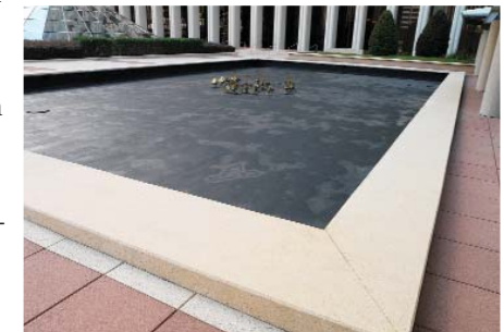
A renewed, pristine look from fountain repair and recoating.